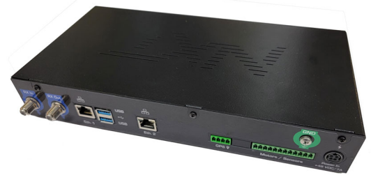
Controller Rear View